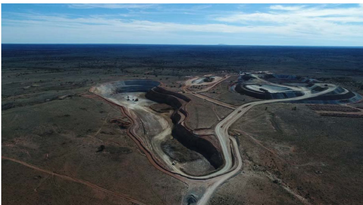
Figure 3: – Perseverance pit with Deliverance target zone beneath and immediately behind the far wall of the pit.

A recent photograph of the Perseverance pit is shown in Figure 3. The Deliverance target zone scheduled for early drill testing lies beneath and immediately behind the far wall in the pit.